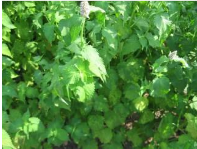
Fig. 6. Plants of lofant grade blue giant phase in early flowering with symptoms of viral infection, 2012

infection. The disease is manifested on the leaves of all layers in the form of diffuse chlorotic mosaic, which occupied almost all of leaf lamina (Fig. 6, 7).