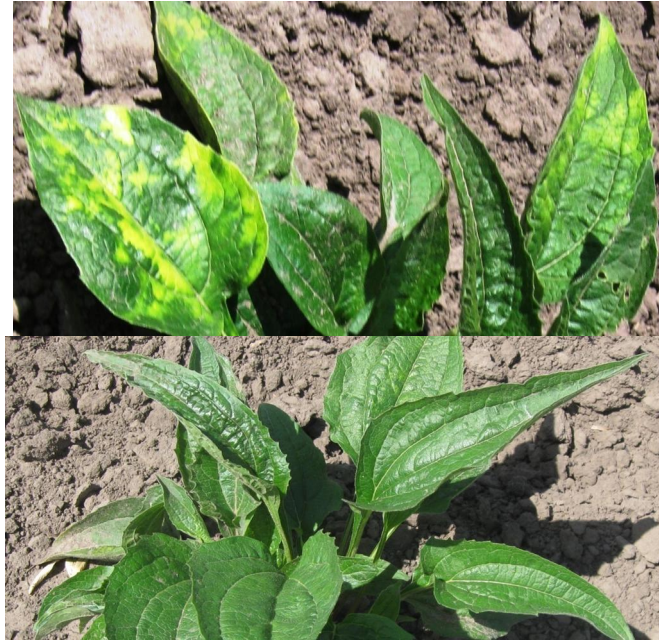
Fig. 4. Symptoms destruction plant Echinacea juice inoculated Chenopodium quinova during transmission by triad Koch (top), control healthy plants (bottom)

By electron microscopy in leaves were found echinacea rod viral particles of 40 \text{ nm} \pm 10 and 100 \pm 10 \text{ nm} \times 17 \text{ nm} with a clear channel (Fig. 5).