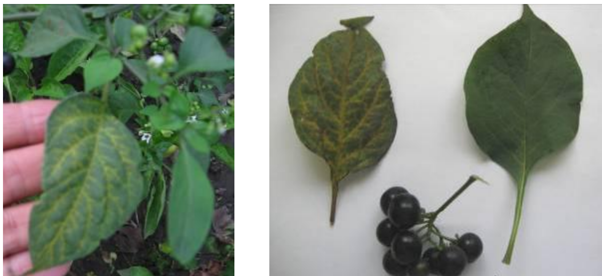
Fig. 11. Leaf sanberri ( Solánum retrofléxum ) with symptoms of viral infection (left) after inoculation juice with mint diseased plants

mosaic 35 days after infection (Fig. 11). This kind of hybrid nightshade for biological testing viruses medicinal plants used by us for the first time.