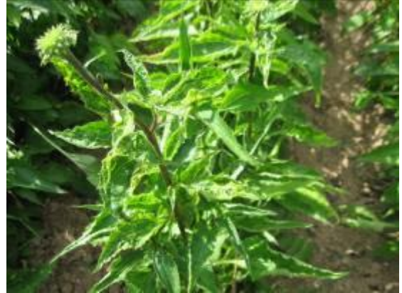
Fig. 1. Field crops echinacea in budding symptoms of viral infection

Gradually, light green leaves chlorotychnist in a phase early flowering passed into a yellow spot, which occupied almost the entire plate puff at the end of flowering phase culture. In the flowering phase revealed severe symptoms of viral infection on plants Echinacea (Fig. 2).