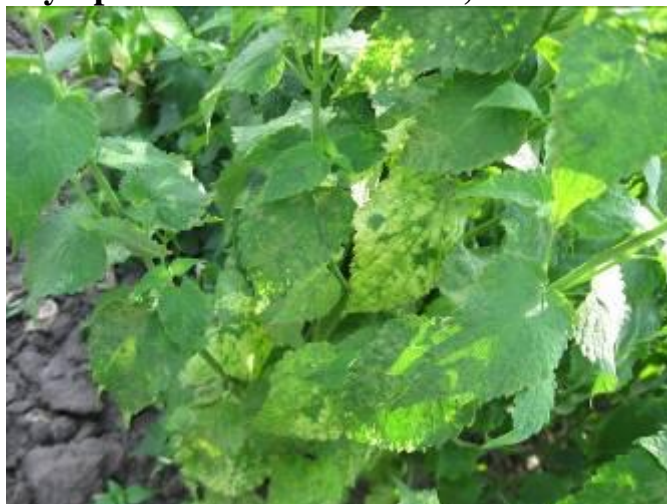
Fig. 7. Detail of diseased plants with mosaic symptoms on leaves of lofant

In young leaves mosaic patches merged, resulting plate had a light yellow color. In older leaves chlorotic spots interspersed with green areas, forming a characteristic mosaic patterns. The color of the veins remain green. In plants with the described symptoms were found spherical virus particles with a diameter of 110 \pm 10 nm [1, 2]. For us morphology recorded viruses like viruses genus Tospovirus family Bunyaviridae, which are spherical virions of different sizes: 50, 80 and 120 nm [14]. Members of this genus affect a wide range of single and dicotyledonous plants that do not have explicit specialization and transmitted thrips, which may explain their presence on plants lofanta.