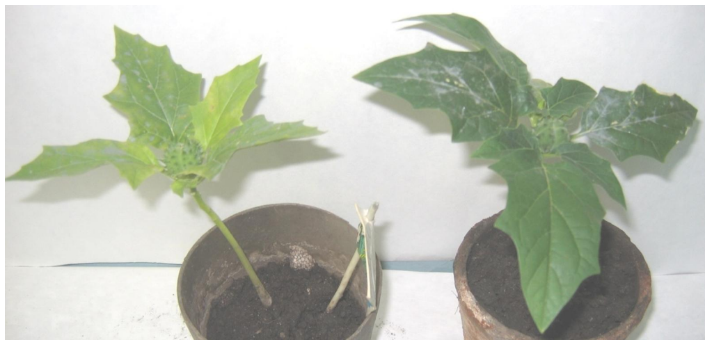
Fig. 8. yellowing and necrosis appearance on the leaves of plants Datura stramonium after inoculation juice from diseased plants lofanta (left – research, right – control)

Among the investigated indicators on plants inoculated with the sap of diseased plants reacted lofant plant Datura stramonium advent of the 25-day local necrosis and yellowing leaves (Fig. 8). Note that looks dope on the symptoms were similar to those observed in lofant.