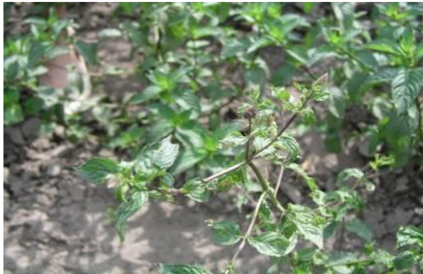
Fig. 9. The symptoms of viral diseases in plants Mentha piperita L. grade Chornolysta

In [9] in mint roots Prylutska 6 and Krasnodar 2 also revealed viral particles of different sizes. In the roots of infected plants Mentha piperita grade Chornolysta in our studies of viruses found.