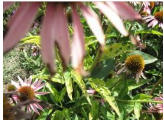
Fig. 2. Severe symptoms of viral infection on the leaves of Echinacea in bloom phase

Properties viruses studied by biological testing Indicator plant. Among the indicators used to hit the juice of the plant Echinacea patients reacted D. stramonium and Chenopodium Quino. On the 20th day after inoculation on leaves Ch. Quino local necrosis appeared light brown with dark brown halo diameter of 2-3 mm (Fig. 3).