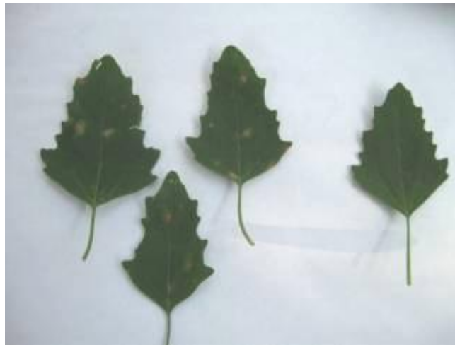
Fig. 3. Necrotic reaction on leaves Chenopodium Quino infected sap of infected plants Echinacea (right – control).

The results of our testing of biological coincide with very limited published data [3]. The authors also found small local necrosis of about 1 mm on plants Chenopodium hybridum , infected leaves juice of Echinacea .